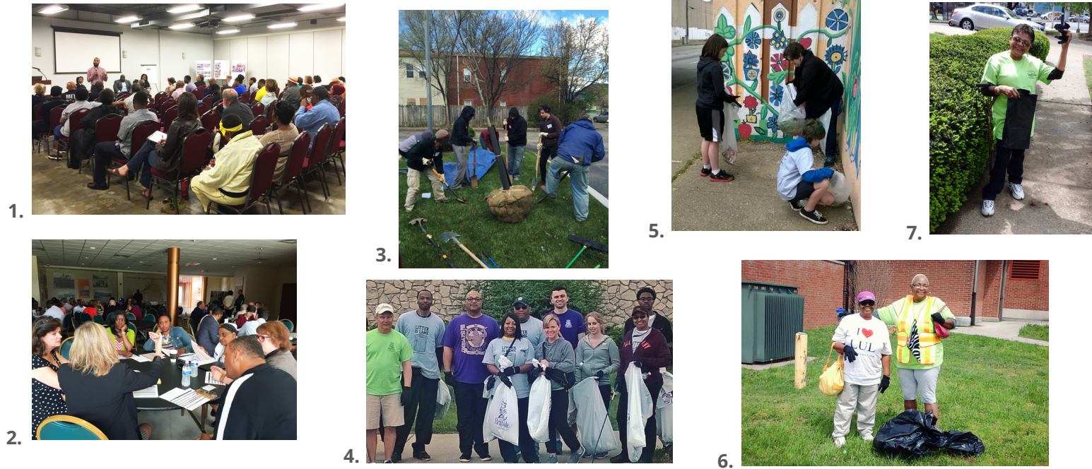
1. Community Conversation on Crime and Safety at the Louisville Central Community Centers 2. Vision Russell Joint Task Force Meeting at the Kentucky Center for African American Heritage 3. Louisville Grow's Russell Tree Planting Day 4&5. Louisville Metro Government & Louisville Metro Housing Authority Cleanup Day in Russell 6&7. Louisville Urban League Cleanup Day in Russell

Louisville Metro Housing Authority 420 S. 8th Street Louisville, KY 40203 Phone: (502) 569-3400 www.visionrussell.com