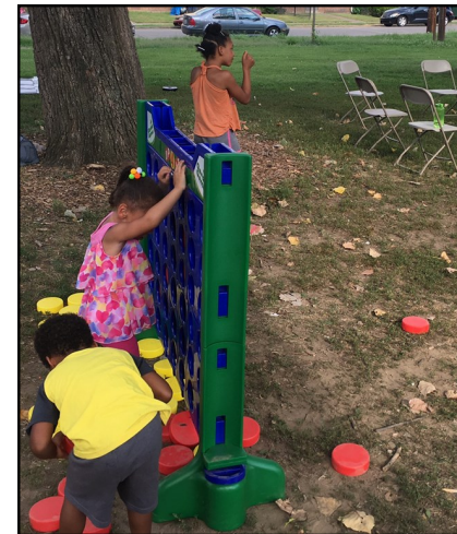
Above: Urban Strategies hosted an ice cream social at Baxter Square Park in July offering frozen treats, outdoor games, and an opportunity to play with miniature robots!