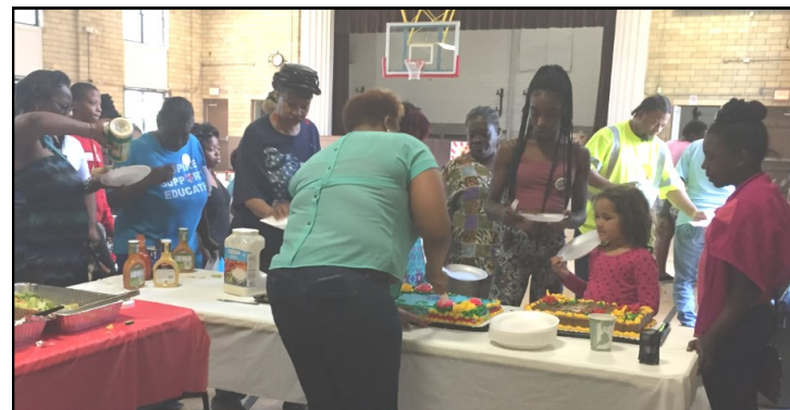
Left: Urban Strategies hosted Women Who Wow in May— an event to celebrate Mother's Day and the women in Beecher Terrace who bring positivity and strength into the community.

Urban Strategies' Office is located at 434 S. 10th Street and open M-F 9:00 a.m.– 4:30 p.m. Their phone number is (502) 384-0786.