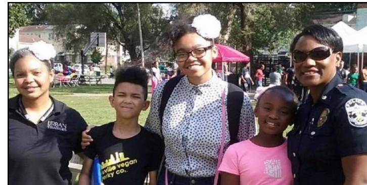
Above: Hundreds of families from the Russell Neighborhood, including residents from Beecher Terrace, participated in Metro Louisville's National Night Out event at the Baxter Square Park on August 1st.