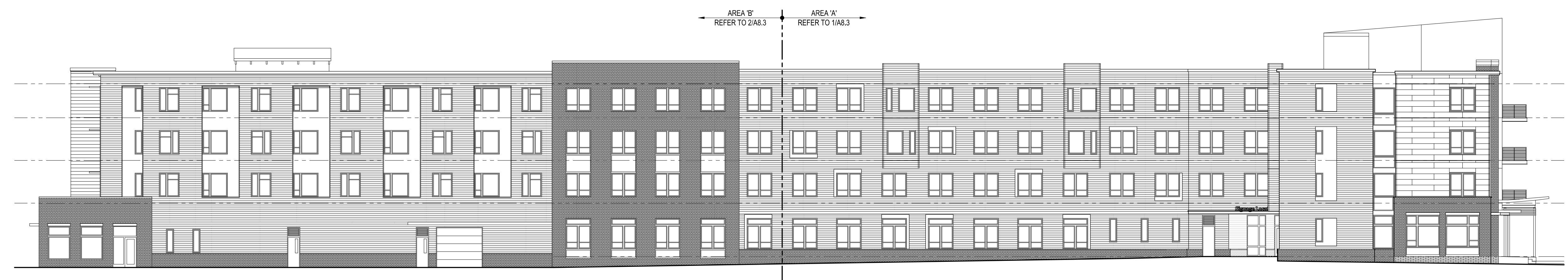
4 SOUTH ELEVATION SCALE: 1/16" = 1'-0"