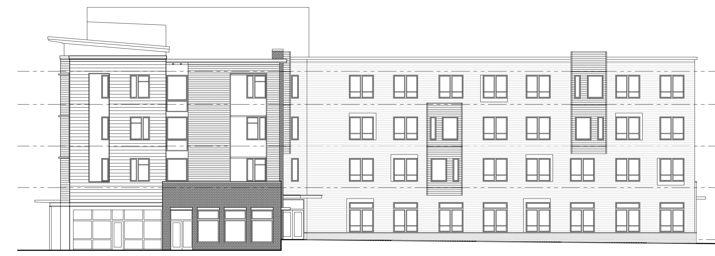
2 WEST ELEVATION SCALE: 1/16" = 1'-0"