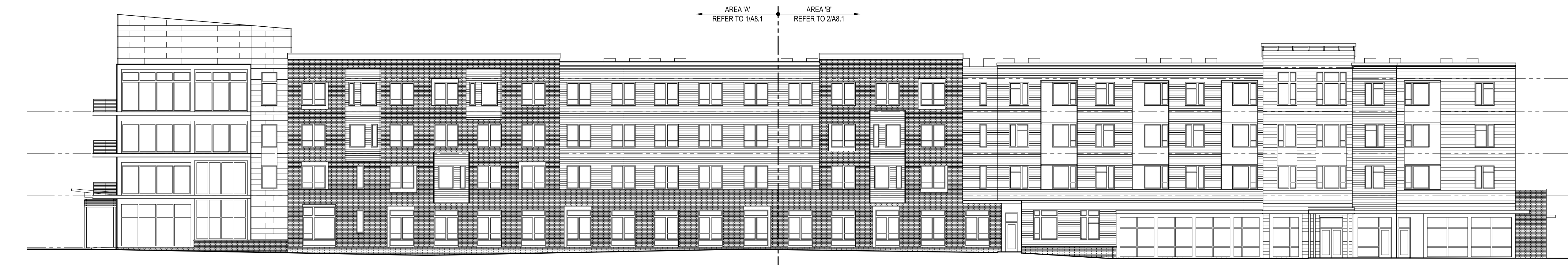
1 NORTH ELEVATION SCALE: 1/16" = 1'-0"