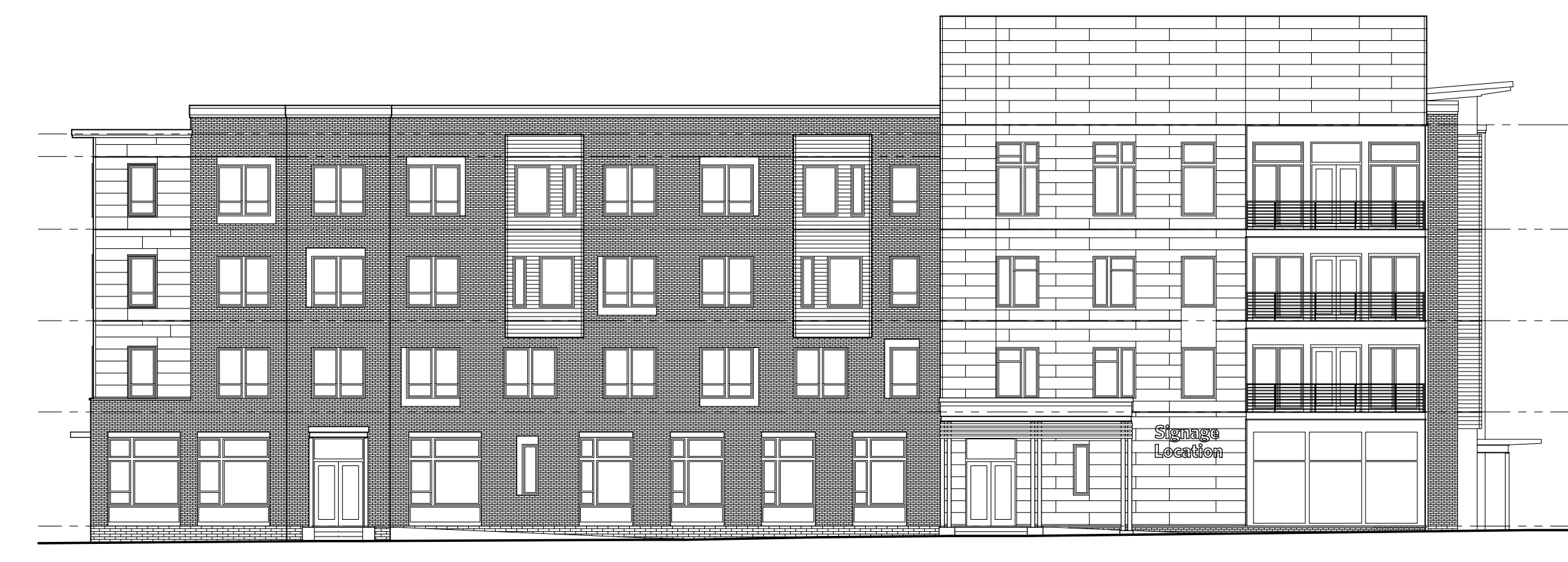
3 EAST ELEVATION SCALE: 1/16" = 1'-0"