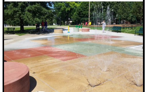
Above: Sheppard Park's new sprayground, located at 1601 Magazine St.