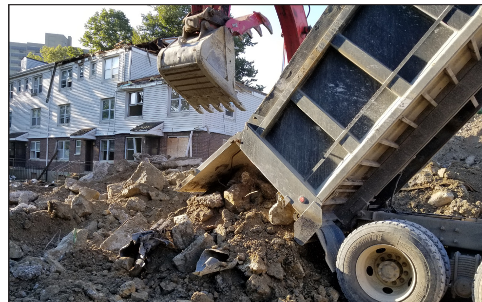
Cardinal Demolition Company, on-site work underway.

After some initial delays, demolition work has finally begun on the northeastern corner of the Beecher Terrace site. A total of nine residential buildings located between 9th and 10th streets near Jefferson Street are included in this first phase of demolition, which will make way for the first phase of housing redevelopment. The Mini-Versity West Downtown Child Development Center will remain open during demolition and hopes to expand their current campus in conjunction with Beecher's redevelopment.