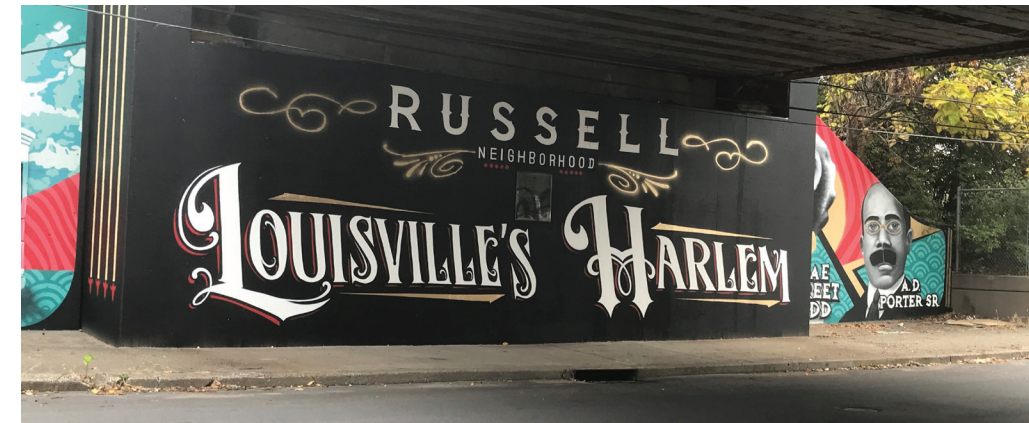
OSRS's mural on Chestnut highlights Russell's days as "Louisville's Harlem" when African American theaters, restaurants, and night clubs lined area streets.

Often Seen but Rarely Spoken's (OSRS) mural on Chestnut Street harkens back to Russell's past as "Louisville's Harlem" and features A.D. Porter and Mae Street Kidd. Russell's future is represented by youth imagining their dream careers.