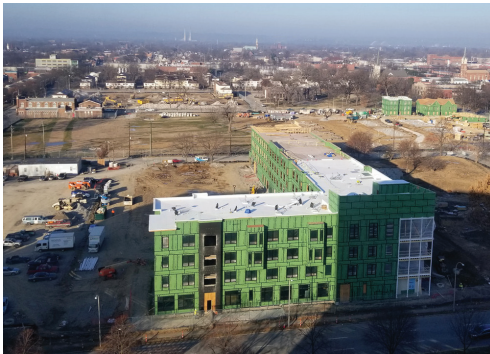
Beecher Terrace construction site showing Phase I and II progress, as of December 19, 2019.

On December 27, Mayor Greg Fischer and U.S. Rep. John Yarmuth announced that Louisville’s Choice Neighborhoods program in Russell is receiving a $4 million federal grant to further its work on the Beecher Terrace revitalization. This is Louisville’s fourth Choice Neighborhoods grant for the Russell neighborhood.