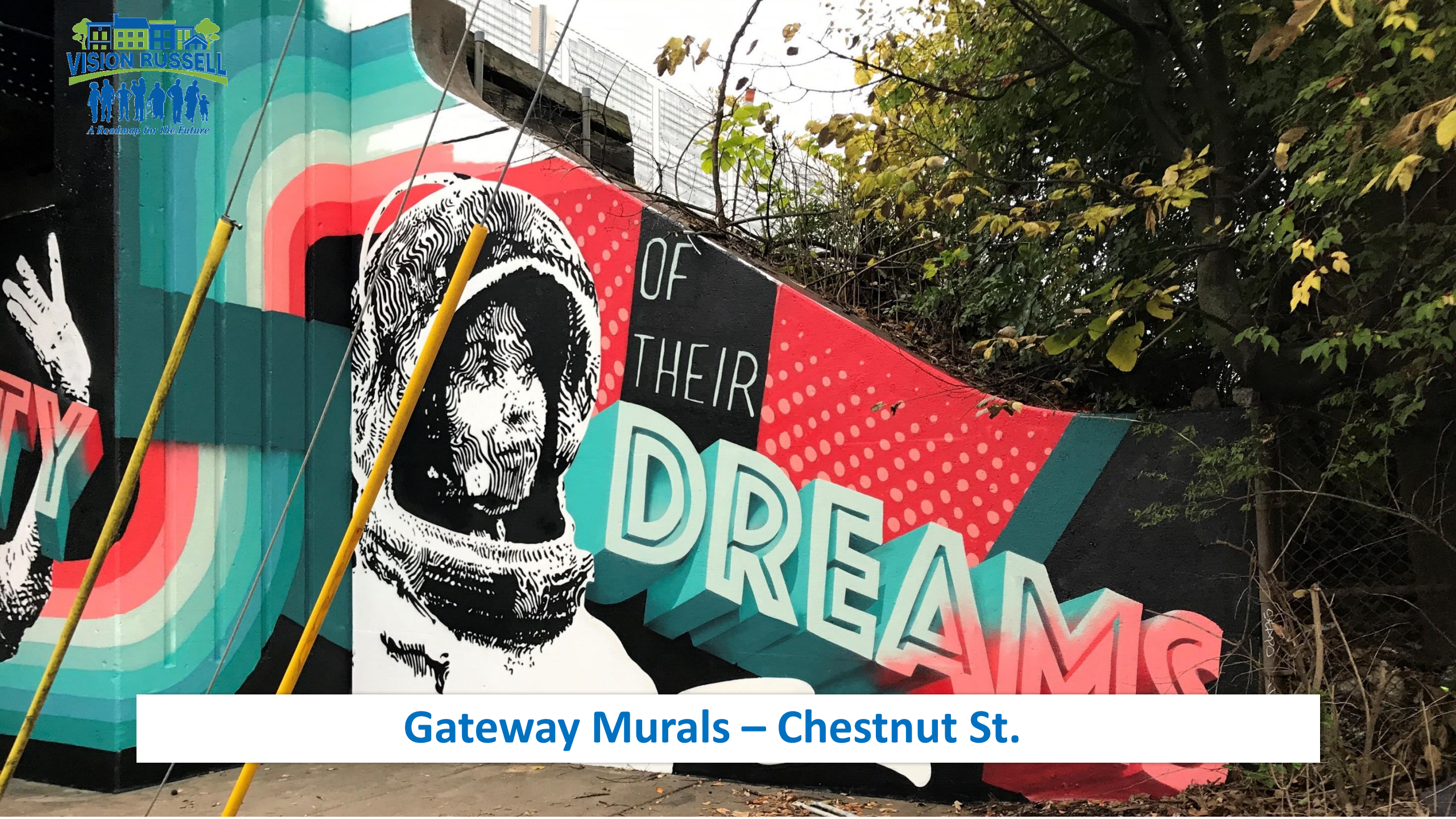
Gateway Murals – Chestnut St.