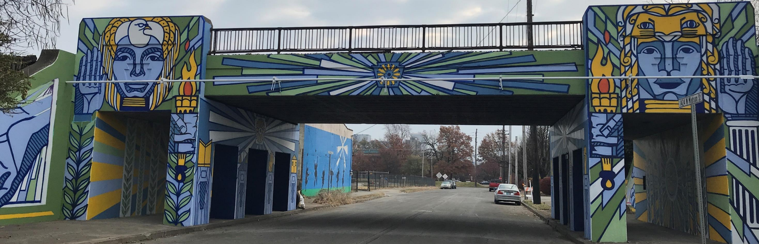
Gateway Murals – Madison St.