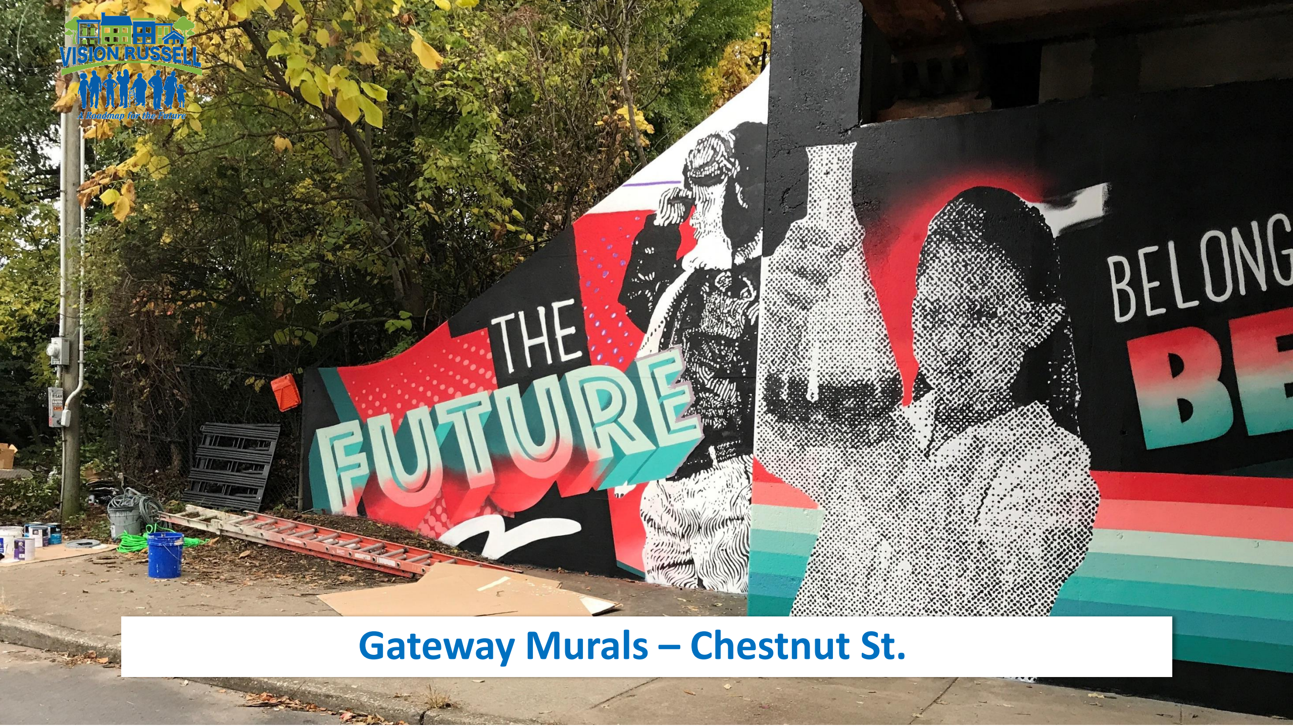
Gateway Murals – Chestnut St.