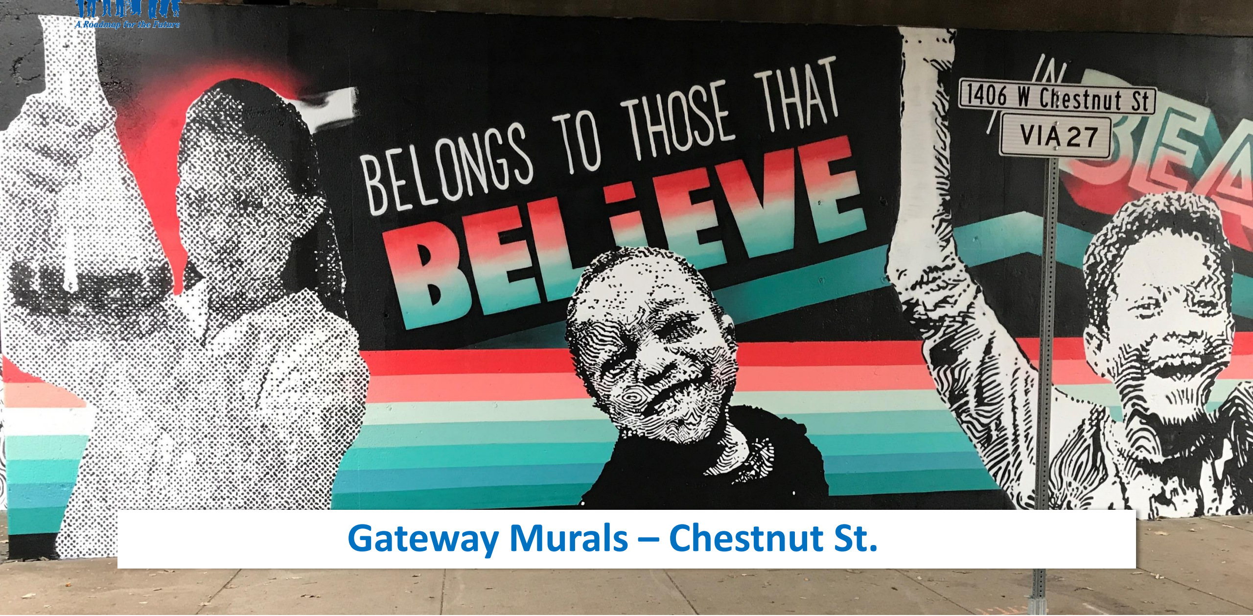
Gateway Murals – Chestnut St.