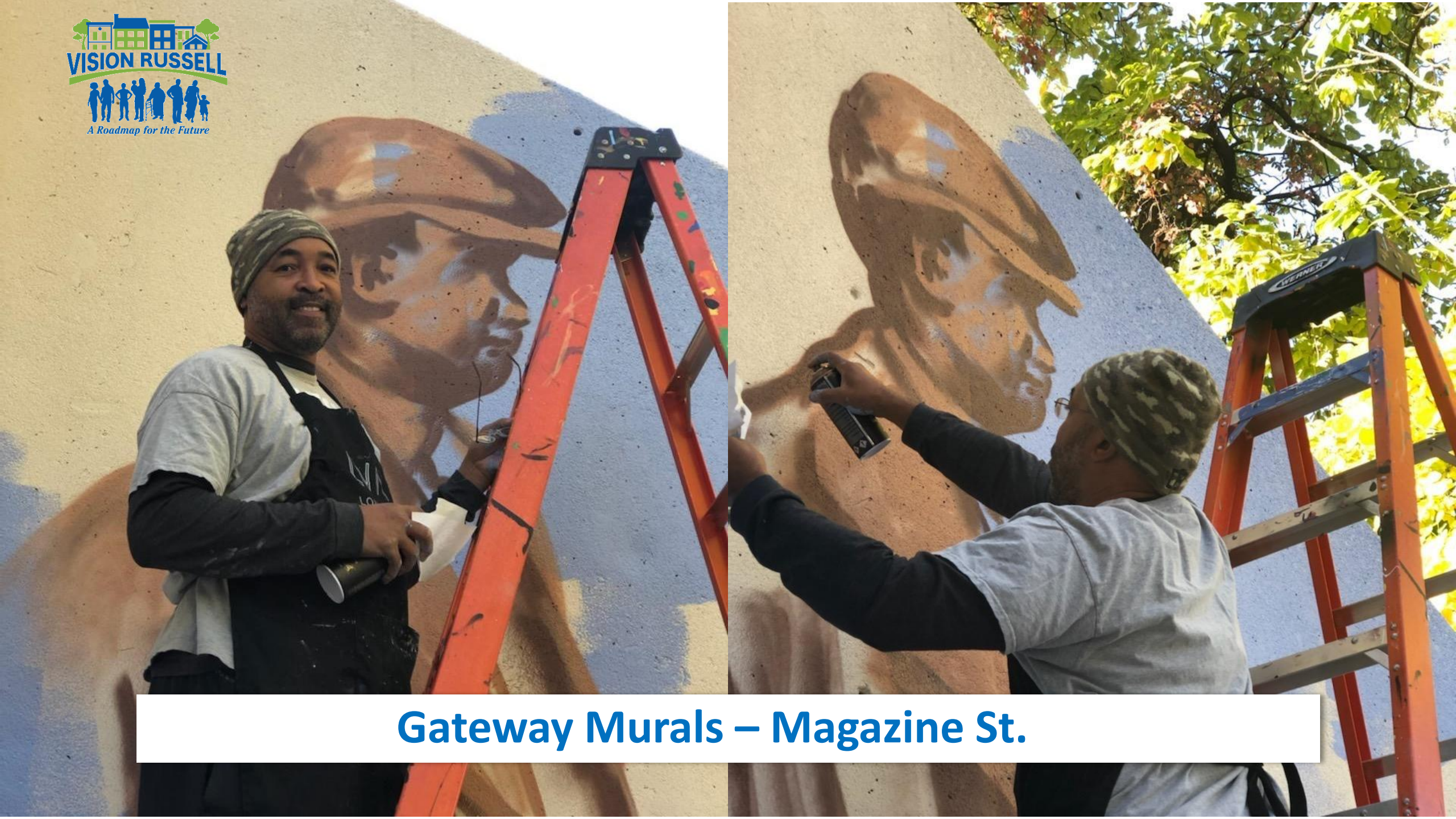
Gateway Murals – Magazine St.