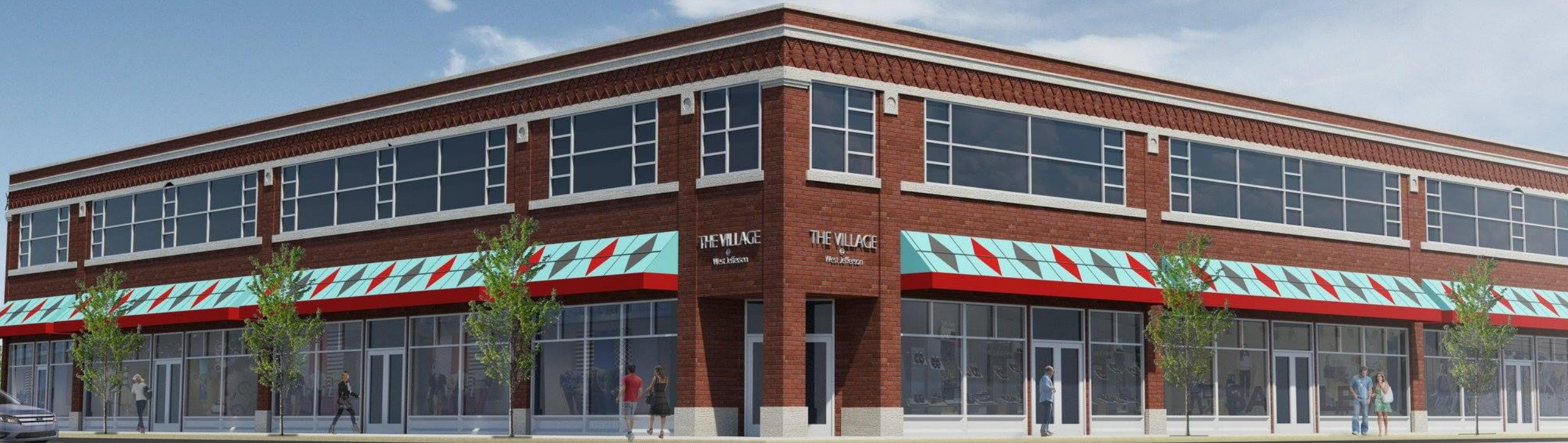
The Village @ West Jefferson