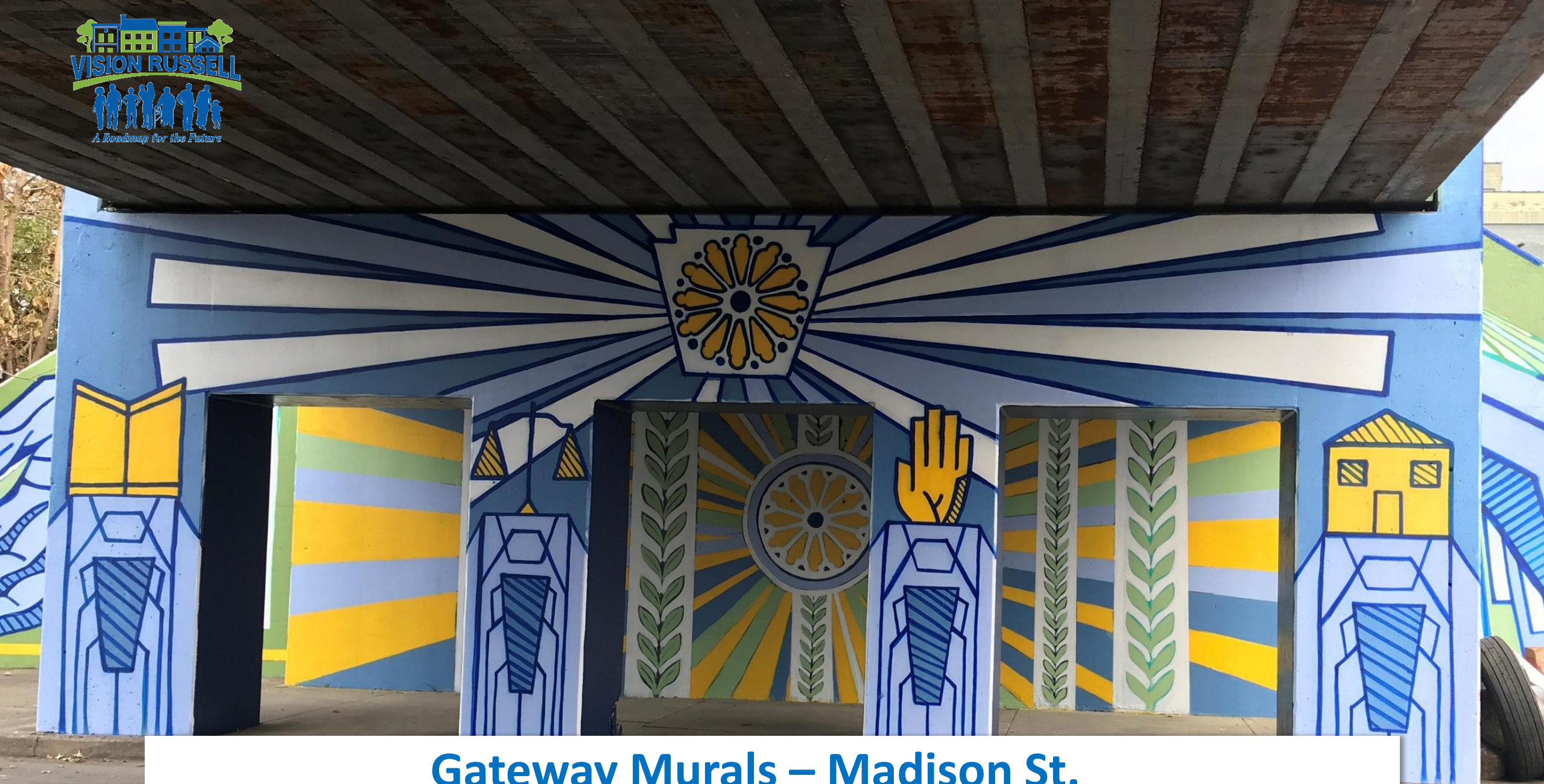
Gateway Murals – Madison St.