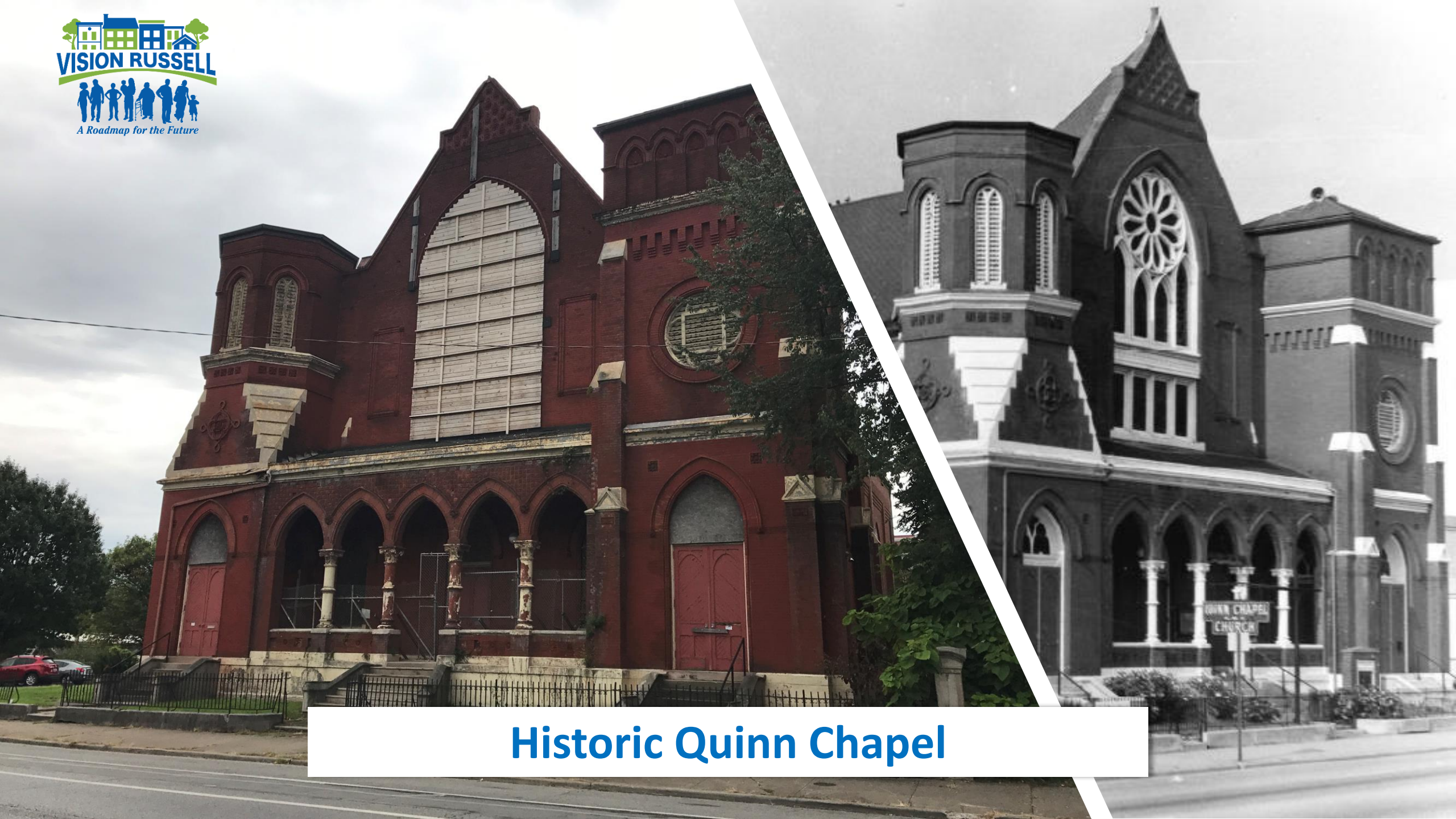
Historic Quinn Chapel