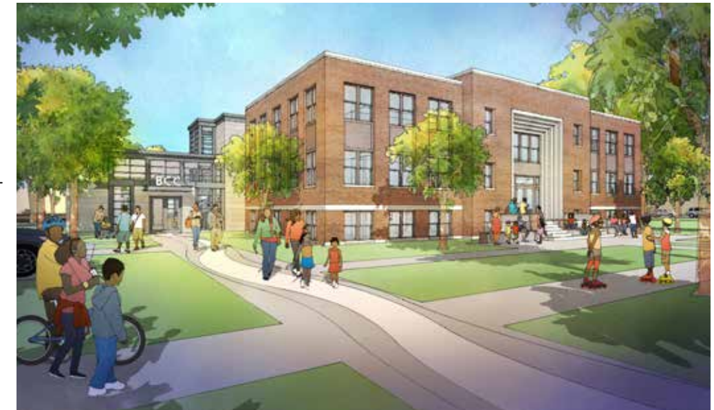
Vision for the Baxter Community Center

Following a series of resident and other stakeholder meetings, the planning firm of Urban Design Associates created preliminary design concepts for these two recreational amenities which will better serve the needs identified by the community. The vision for the restored Baxter Community Center has the building serving again as a recreational and educational center, with a new addition and elevator on the west side that makes the center fully accessible. The vision for the Porter Paints site