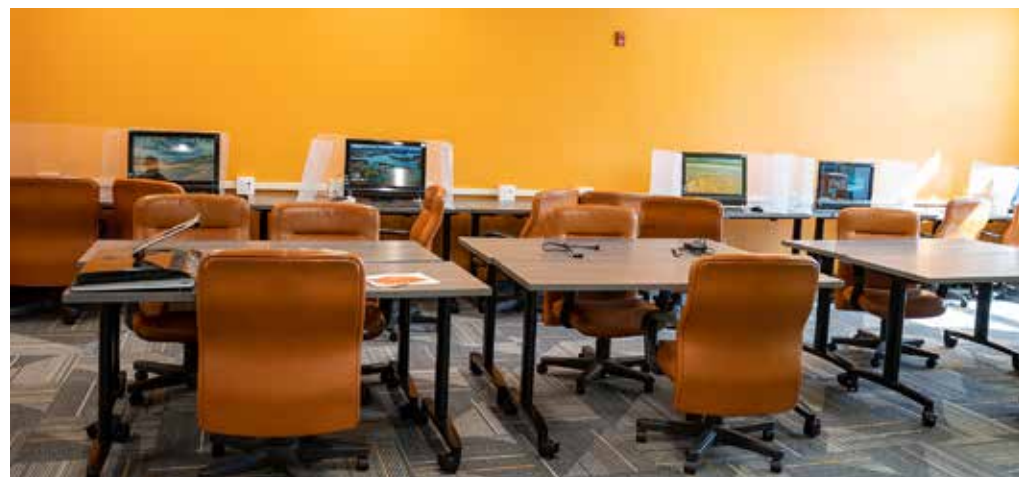
MOLO Village CDC Computer Resource Center