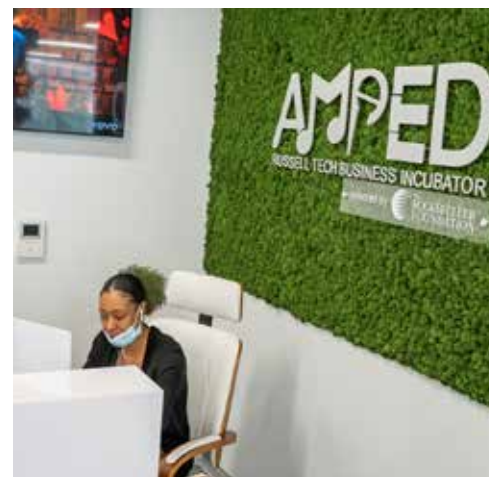
AMPED's offices at the Village @ West Jefferson