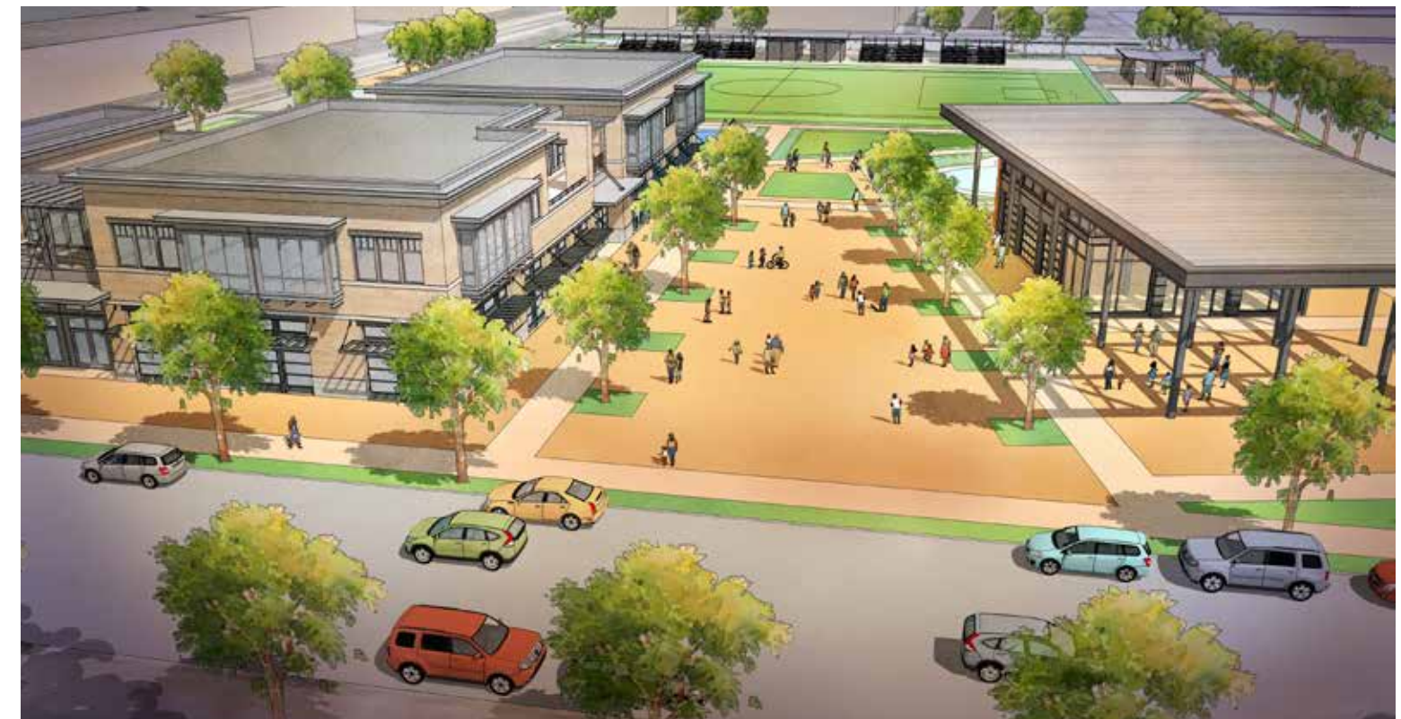
Vision for the former Porter Paints site

Conceptual drawings, along with additional information about the ongoing community engagement process and fundraising efforts, can be found at www.visionrussell.org and www.engagetheteam.com/BeecherTerrace . Phased construction is expected to begin soon, and both projects are anticipated to be completed sometime in 2022.