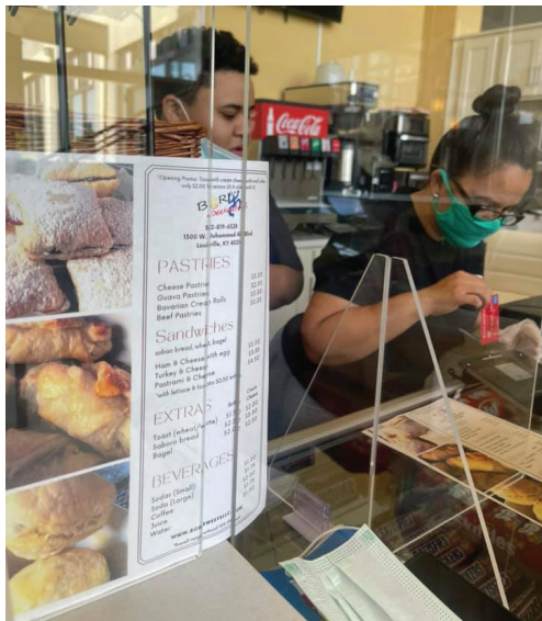
Bori Sweets in the LCCC Business Plaza

Looking for someplace to eat right here in the neighborhood? You're in luck, because Russell has a growing number of great locally owned restaurants. With new additions like Tha' Drippin' Crab and Bori Sweets, and old favorites like Club Cedar and Sweet Peaches, there's something to satisfy everyone's tastes. Here are just a few of Russell's dining options: