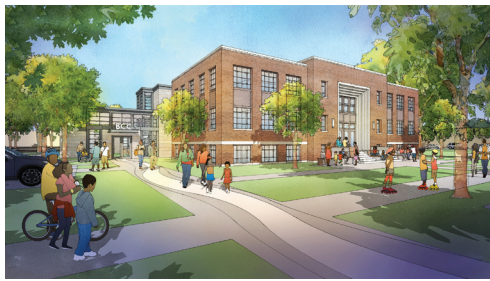
Rendering of Planned Improvements for the Baxter Community Center.

the creation of a new 5.7-acre park at the corner of S. 13th Street and W. Muhammad Ali Blvd.