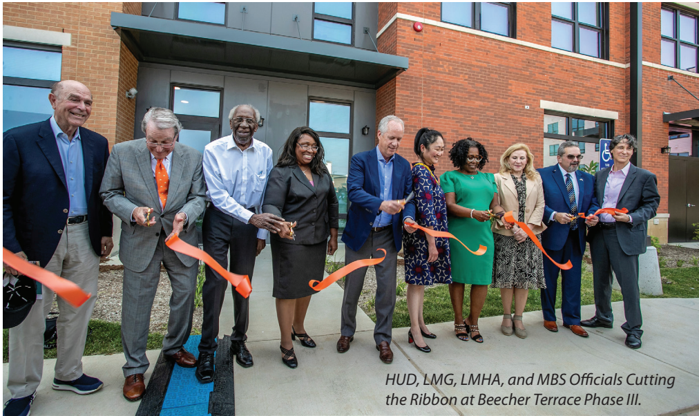
HUD, LMG, LMHA, and MBS Officials Cutting the Ribbon at Beecher Terrace Phase III.

Beecher Terrace has a new look, but the “heart” of the community remains the same.